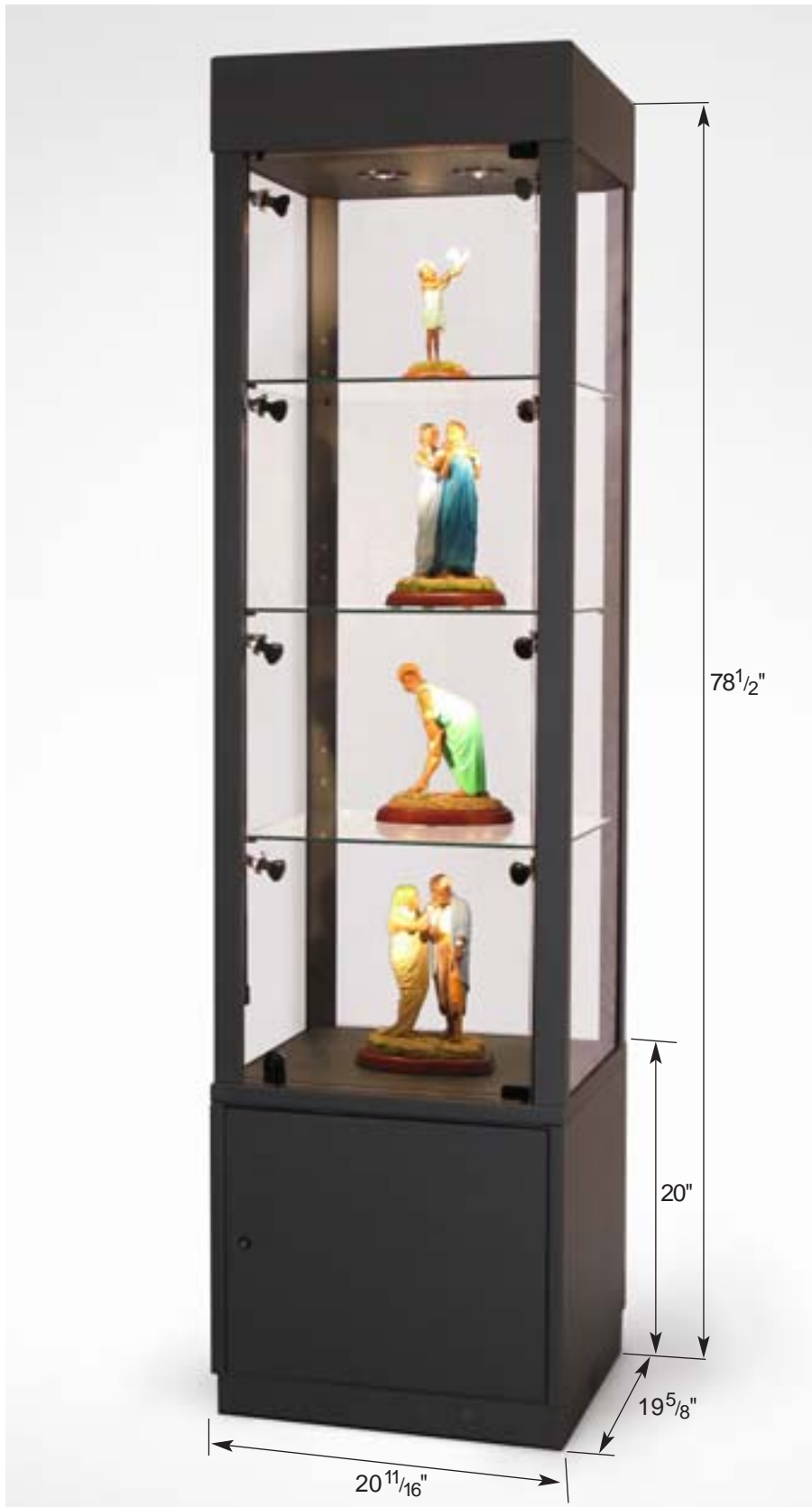
Showcase shown is a standard ST Halogen in Black Wrinkle powder coated finish.