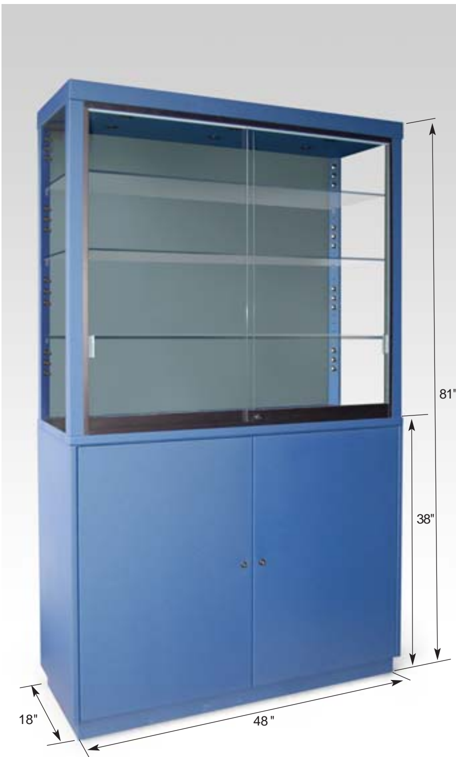
Showcase shown is a standard CM56 powder coated in blue wrinkle with metal back panel powder coated in charcoal