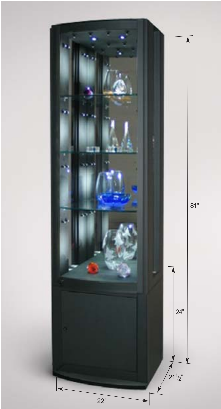
Showcase shown is a CM40 modified with optional mirrored back. Powder coated in Black Wrinkle finish.