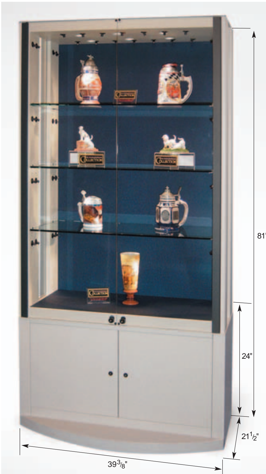
Showcase shown is a standard CM3 in White Silver Vein powder coated finish with solid metal back, powder coated with Blue Wrinkle finish.