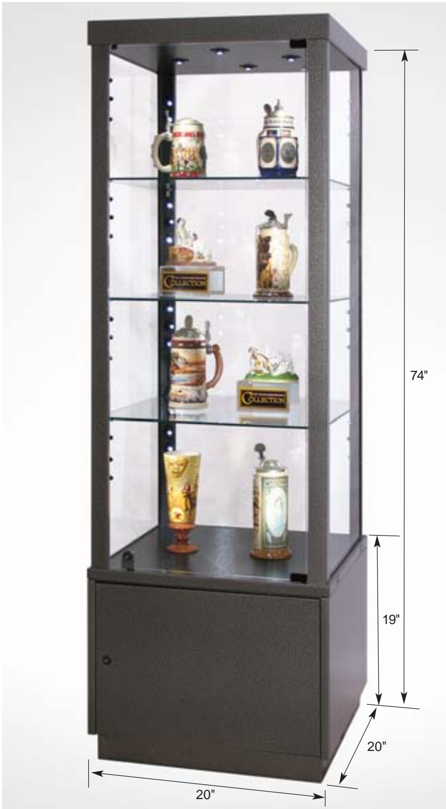
Showcase shown is a standard CM14 powder coated in Black Wrinkle finish with standard glass back.